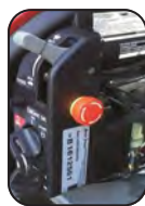
Emergency stop fitted standard on all Class B jetters