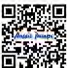
Click or scan QR code for Aussie Jetter handover video