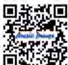
Click or scan QR code to see launch video