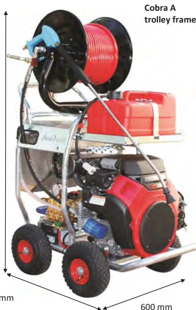
Cobra A trolley frame